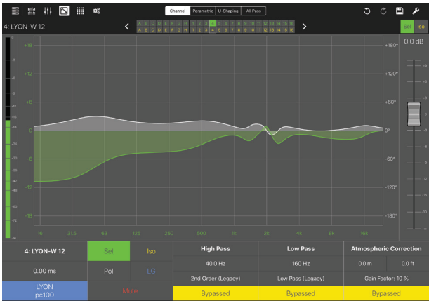
Compass Go Screen